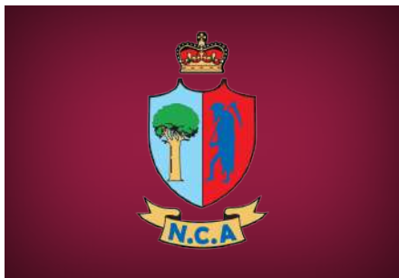
Northland Brian Dunning Cup