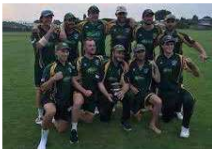
Mount Maunganui CC Eric Petrie Cup