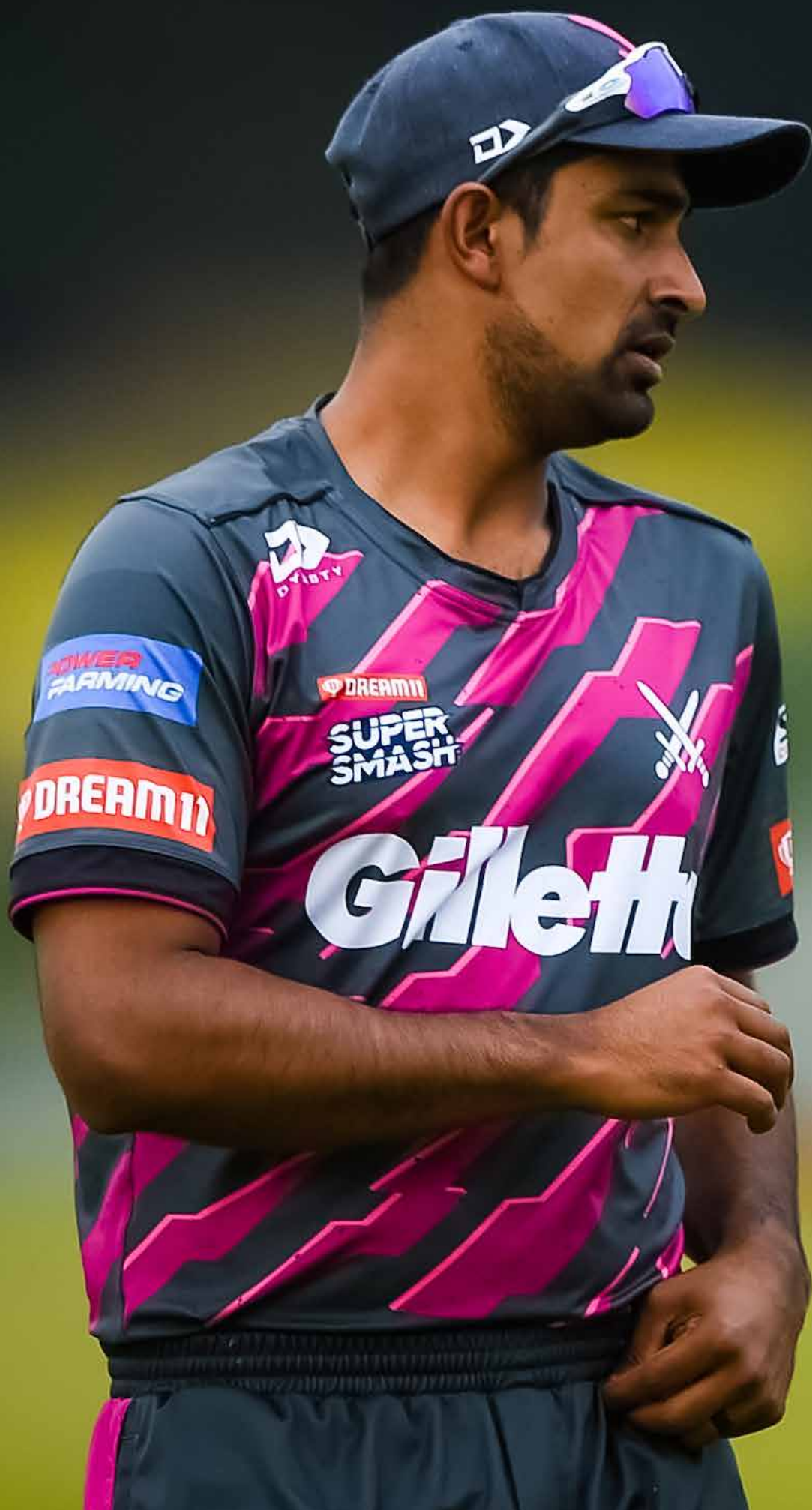
Ish Sodhi of Northern Knights during the Dream11 Super Smash T20 cricket match, Otago Volts v Northern Districts Knights at Molyneux Park, Alexandra, Sunday, 29 December, 2019.