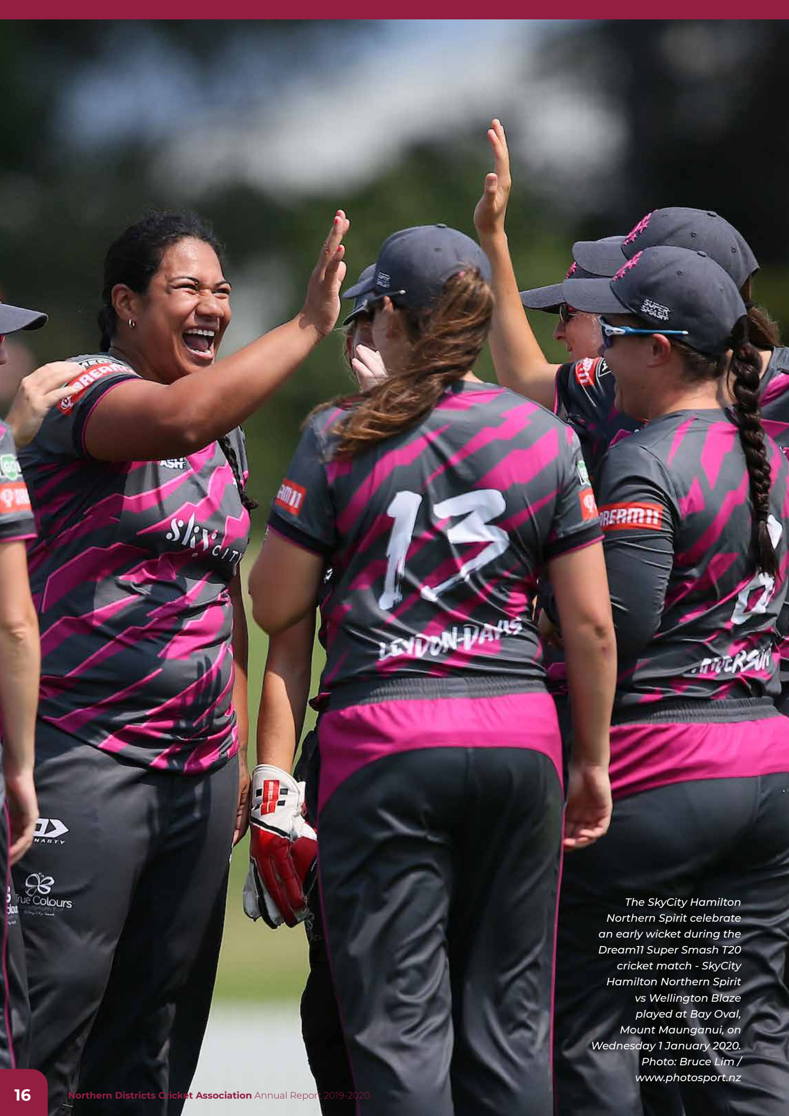
The SkyCity Hamilton Northern Spirit celebrate an early wicket during the Dream11 Super Smash T20 cricket match - SkyCity Hamilton Northern Spirit vs Wellington Blaze played at Bay Oval, Mount Maunganui, on Wednesday 1 January 2020.