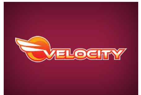
Velocity SKYCITY Hamilton Northern Premier League Champions Trophy T20 Team